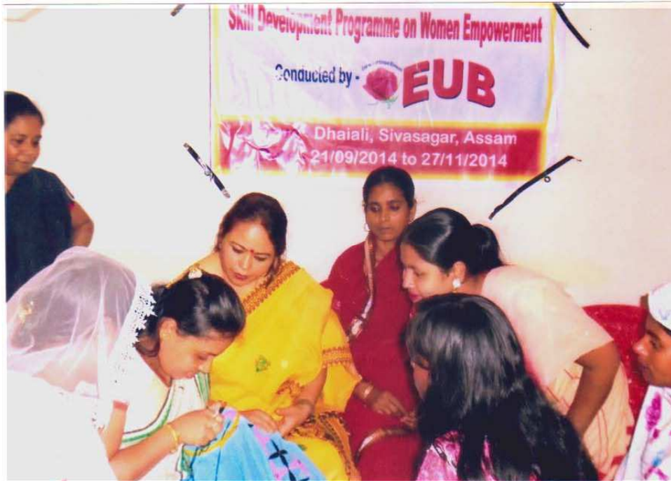
Skill Upgradation Training on Women Empowerment