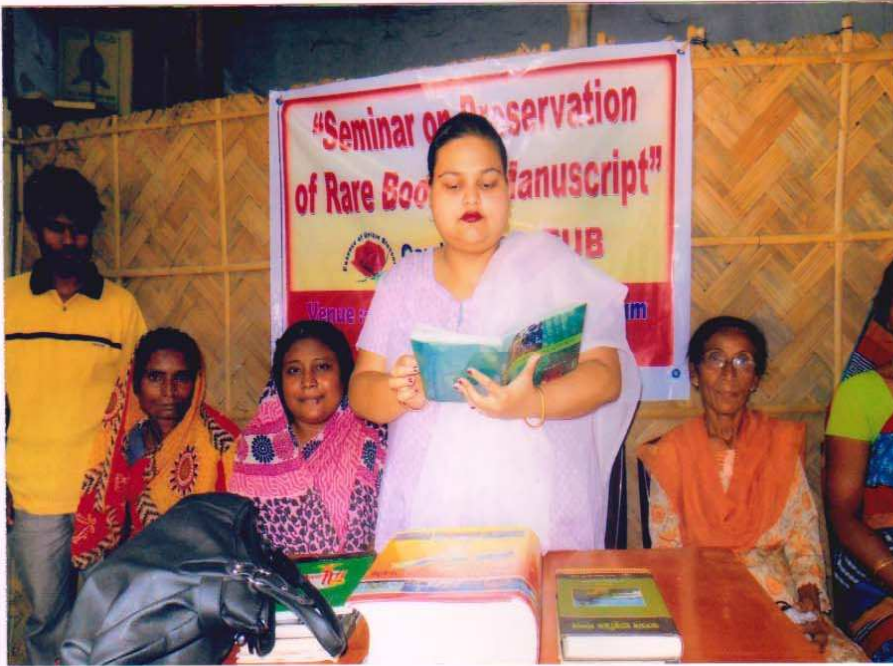
Seminar on Preservation of Rare Books and Manuscripts