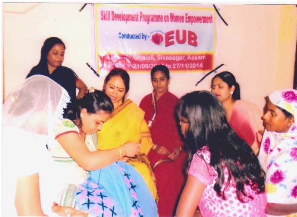
Skill Upgradation Training on Women Empowerment